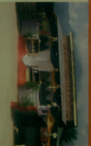
MFPPI Product Promotion Pavilion at Mwalimu Juilius Kambarage Nyerere agricultural Show ground.

The cluster initiative has a very strong collaboration with Sokoine University of Agriculture, Morogoro Engineering Cluster Initiative, Municipality, Vocational Education and Training Centre and Small Industry Development Organization.