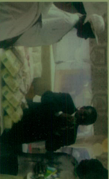
MFPPI Exhibitors listening attentively to business advise from a prominent Tanzanian businessman Mr. Reginald Mengi.

MFPPI Intervention contributes to national development by supporting Fanya Morogoro Gala la Taifa and Kilimo Kwanza