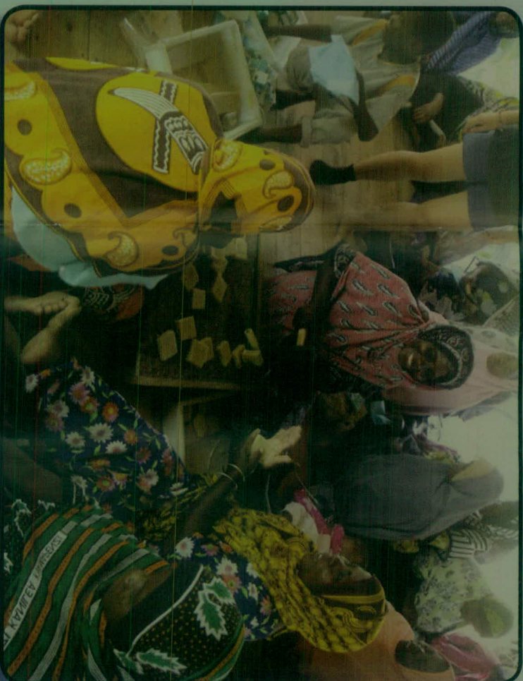
Seaweed Cluster members making seaweed soap

and clothing materials traditionally done by farmers.