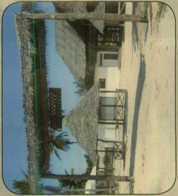
Seaweed Center at Paje village

In Paje village on the East Coast of Zanzibar, a Seaweed Centre is being built by Chalmers School of Entrepreneurship in collaboration with ZaSCI. The Centre that houses facilities for drying and processing seaweed will be used by seaweed farmers in Paje and nearby villages.