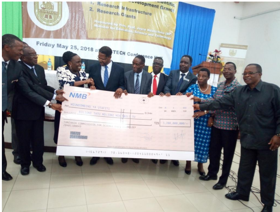
Honorable Minister Prof. Joyce Ndalichako (mid left), the Minister for Education Science and Education, handles the dummy cheque to heads of Tanzania mainland research and academic institutions (right), that won infrastructure call.