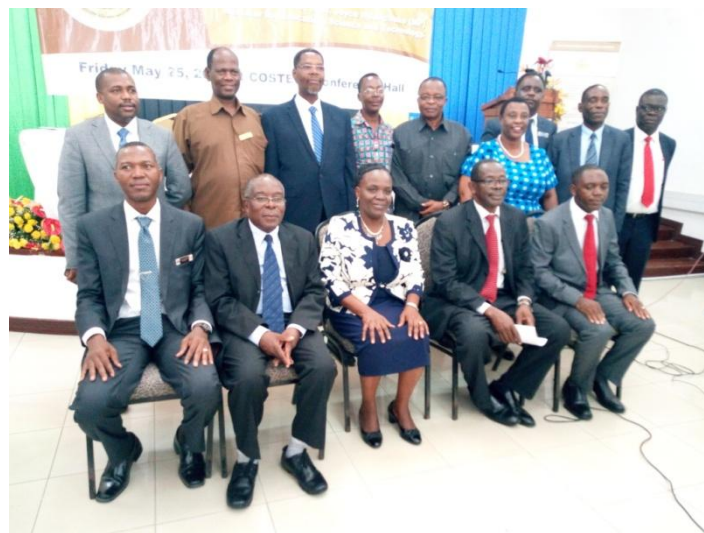
Honorable Minister Prof. Joyce Ndalichako, the Minister for Education Science and Education, poses for a group photo with heads of institutions that won strengthening infrastructure call.

For Zanzibar, eight projects qualified for funding with a total 960 million shilling. These projects are meant to address unique problems facing the isles especially on three thematic areas: (i) sustainable tourism (ii) Agribusiness and aquaculture (spices, horticulture, seaweed and aquaculture) and (ii) non-communicable diseases.